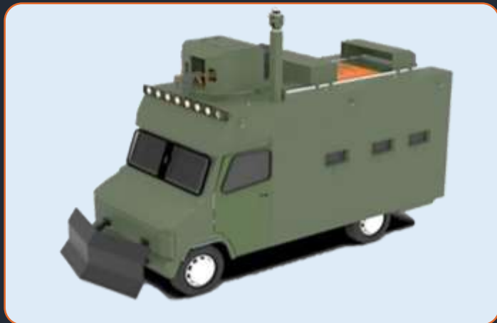
Riot Control Command Vehicle