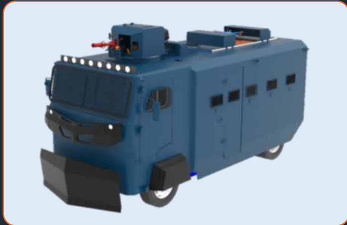
Critical Response Command Vehicle