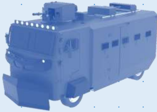
CRITICAL RESPONSE COMMAND VEHICLE