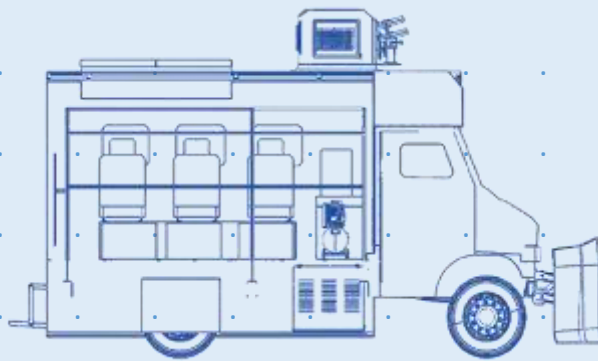
RIOT CONTROL COMMAND VEHICLE